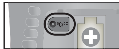
select °C or °F temperature display

To select either °C or °F, push the "°C/°F" button located on the back to switch between °C and °F temperature display units.