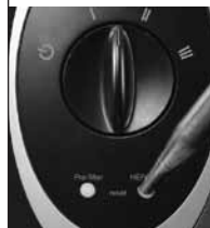
Fig. 4 Will illuminate when it is time to clean HEPA filters

NOTE: None of the filters are washable. Do not immerse them in water.